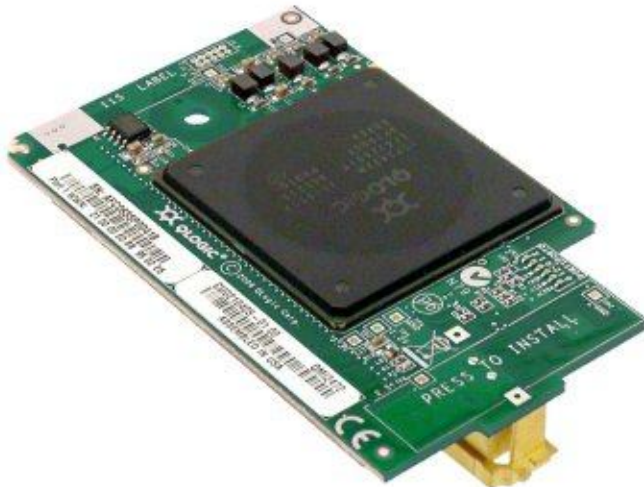
Figure 1. QLogic 4Gb Fibre Channel Expansion Card (CFFv)

The QLogic 4Gb Fibre Channel Expansion Card (CFFv) is shown in Figure 1.