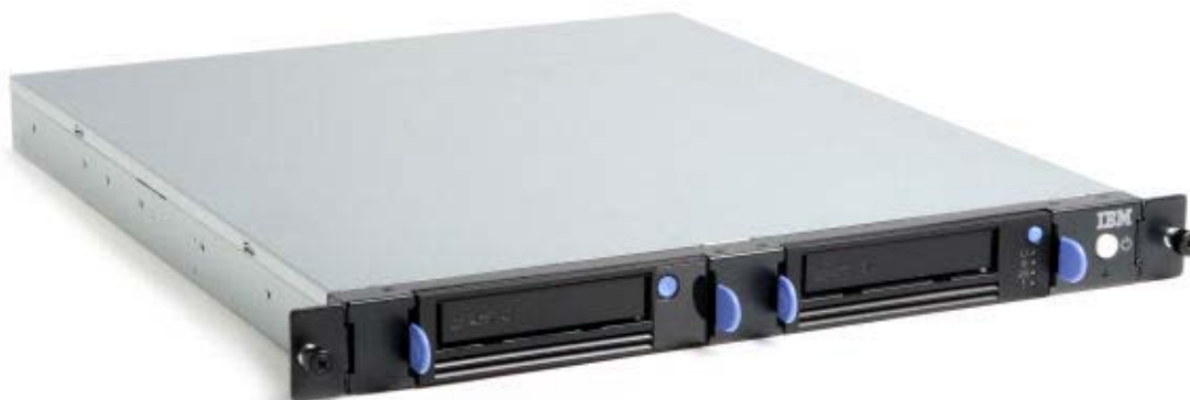
Figure 3. The tape drive installed in the 1U Rack-mount Tape Enclosure

The following figure shows the IBM Half-high LTO Generation 4 SAS Tape Drive installed in the left most bay of the IBM 1U Rack-mount Tape Enclosure (87651UX).