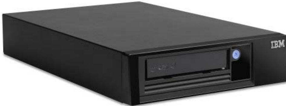
Figure 2. IBM External Half High LTO Generation 4 SAS Drive

Figure 2 shows the IBM External Half High LTO Generation 4 SAS Drive.