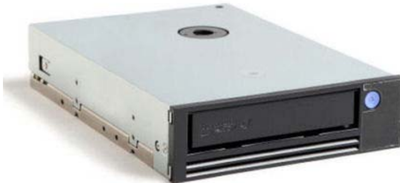
Figure 1. IBM Internal Half-high LTO Generation 4 SAS Tape Drive

Figure 1 shows the IBM Internal Half-high LTO Generation 4 SAS Tape Drive.