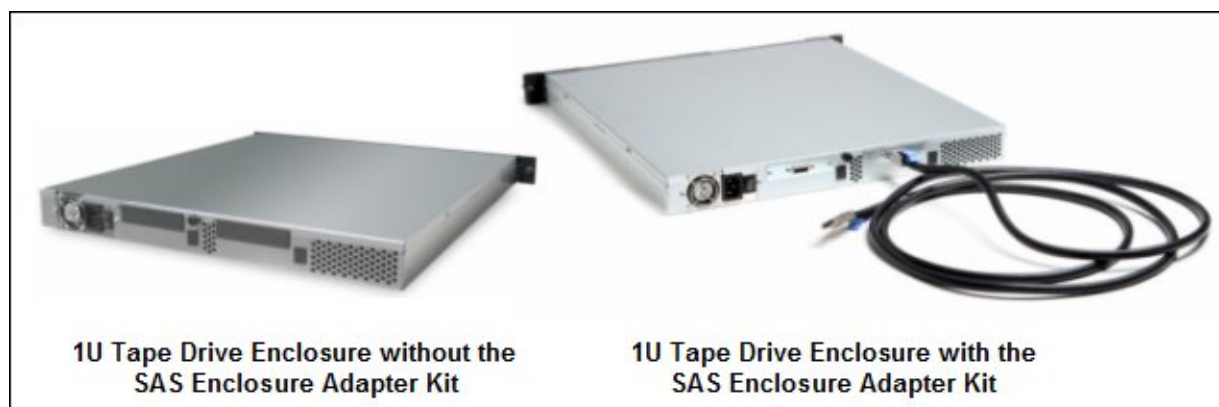
Figure 6. The 1U Tape Drive Enclosure with and without the SAS Enclosure Adapter Kit

The following figure shows an IBM 1U Tape Drive External Enclosure without the SAS Adapter Kit and after installing the SAS Adapter Kit.