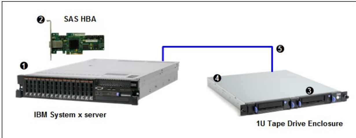
Figure 5. The tape drive installed in an IBM 1U Tape Drive External Enclosure and connected to a System x server

The following figure shows the IBM Internal Half-high LTO Generation 4 SAS Tape Drive installed in an IBM 1U Tape Drive External Enclosure and connected to a System x server.