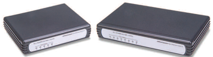
left to right: OfficeConnect Fast Ethernet Switch 5 and Switch 8

Silent operation. Self-cooling fanless design ensures there is no noise disturbance from the switches.