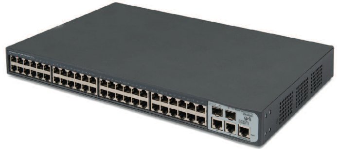
3Com Baseline Plus Switch 2250