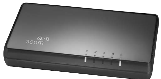
Shown above is the 3Com Gigabit Switch 5 Port 3CGSU05

Operating system independence. Supports maximum integration of different operating systems within a network—no extra configuration of the network is required.