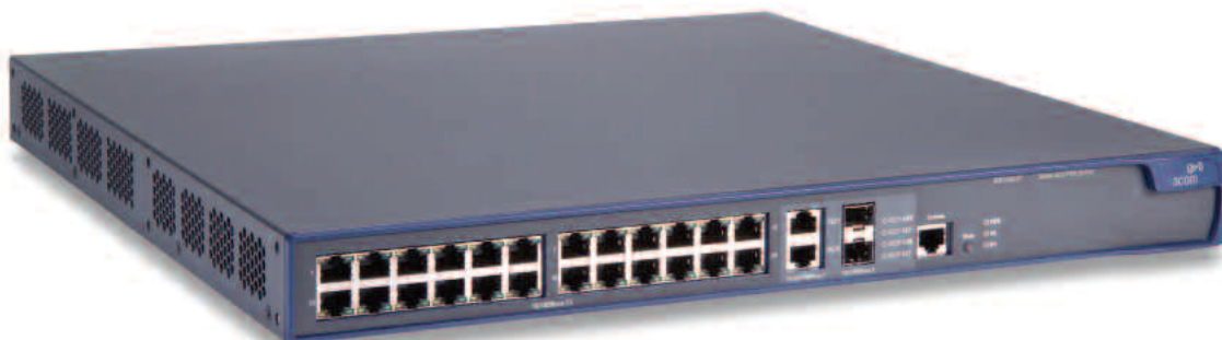
3Com Switch 4210 PWR 26-Port, Switch 4210 52-Port

Limited Lifetime Hardware Warranty, including fans and power supply Limited Software Warranty for 90 days Advance Hardware Replacement with Next Business Day shipment in most regions Limited Lifetime software updates 90 days of telephone technical support Refer to www.3com.com/warranty for details.