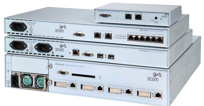
(from top: 3Com Wireless LAN Controller WX4400, Wireless LAN Controller WX2200, Wireless LAN Switch WX1200, WXR100 Remote Office Wireless LAN Switch)

The 3Com Wireless Switch Manager eliminates the time-consuming task of individually configuring each device. Simple and centralized setup makes initial deployment and long term management easier. Accessed from anywhere on the network, the Wireless Switch Manager software lets administrators change parameters of hundreds of managed access points or dozens of wireless switches with just a few keystrokes.