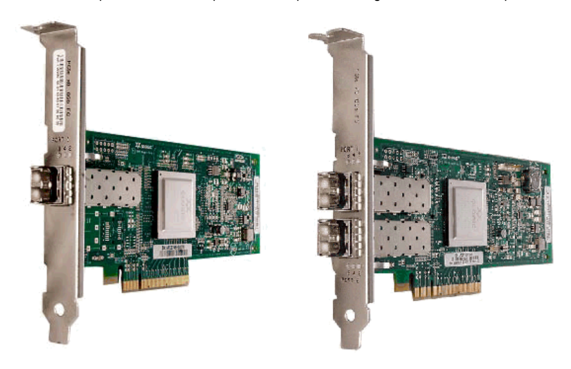
Figure 1. QLogic 8Gb FC Single-port and Dual-port HBAs for IBM System x

The QLogic 8Gb FC Single-port and Dual-port HBA for IBM System x are PCI Express 2.0 x8 8Gb Fibre Channel adapters with SFP+ LC-style connectors . The adapters connect to SFP+ Multimode Fiber SR optical modules. These adapters support 8 Gbps per port maximum bidirectional throughput for high-bandwidth storage (SAN). The PCI Express low profile form factor adapter can be used in either a standard PCI Express slot or a low profile PCI Express slot. Figure 1 shows the adapters.