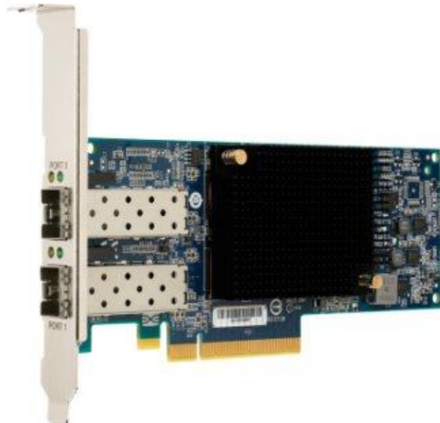
Figure 3. Emulex 10GbE Integrated Virtual Fabric Adapter II (without optional SFP+ transceivers)

The Emulex 10GbE Integrated Virtual Fabric Adapter II (Figure 3) has the same functional characteristics as the Emulex 10GbE Virtual Fabric Adapter II (Figure 1). This adapter must be purchased at the same time as the new IBM eX5 server (x3850 X5 and x3690 X5). It is factory installed into a standard PCIe slot, and is offered at a price savings compared to the Emulex 10GbE Virtual Fabric Adapter II. For this special price, there is a limit of one Emulex 10GbE Integrated Virtual Fabric Adapter II per system. The Emulex 10GbE Integrated Virtual Fabric Adapter II is shown in Figure 3.