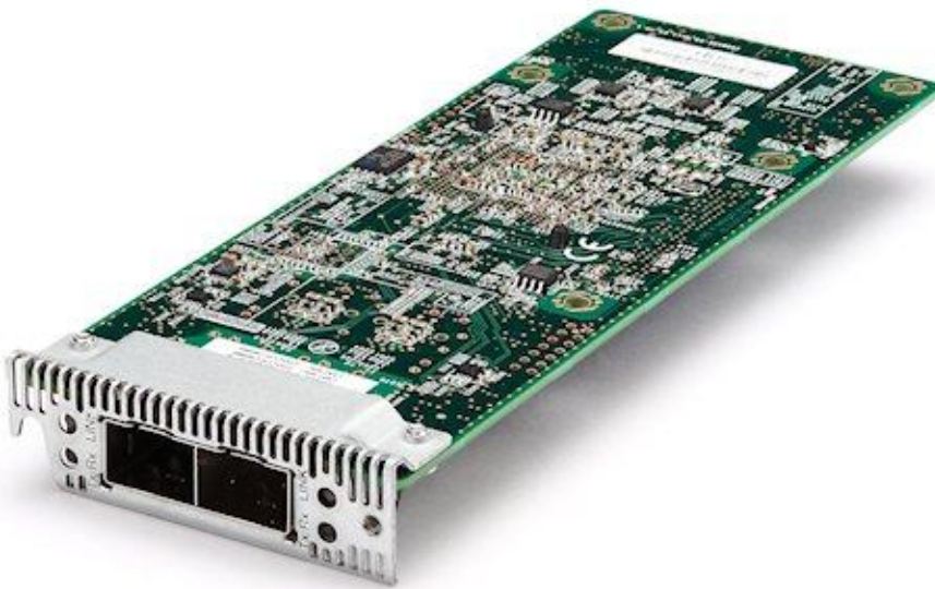
Figure 2. Emulex Dual Port 10GbE SFP+ Embedded Adapter

The Emulex Dual Port 10GbE SFP+ Embedded Adapter is designed to fit into a special slot in selected servers (see Table 4), allowing you to use the PCIe slots for other technologies. The adapter is shown in Figure 2.