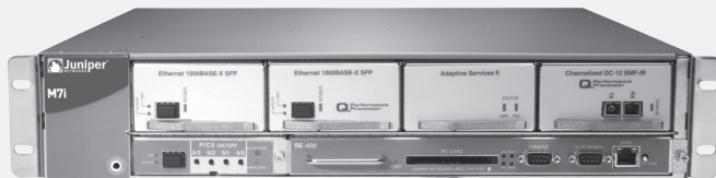
M7i Multiservice Edge Router

All M Series routers support highly scalable J-Protect filtering capabilities, unicast reverse path forwarding and high-performance rate limiting for industry-leading Denial of Service (DOS) attack protection. The J-Protect security capabilities of the M Series can be further enhanced with the Multiservices PIC, hardware that accelerates additional network-based security services such as high-speed NAT, stateful firewall with attack detection and J-Flow accounting. With the rich feature set of Junos OS combined with industry-leading ASIC technology, M Series service-built edge routing provides a new level of reliable and secure service delivery at the edge of service-provider networks.