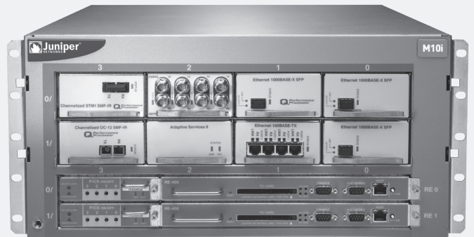
M10i Multiservice Edge Router