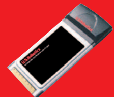
802.11g Wireless Turbo PC Card – Model 5410