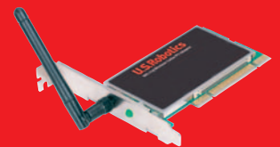
802.11g Wireless Turbo PCI Adapter – Model 5416