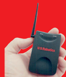
Wireless Turbo USB Adapter – Model 1120