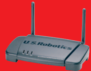
802.11g Wireless Turbo Multi-Function Access Point – Model 5450