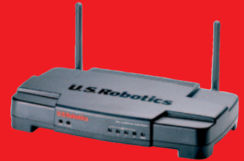
802.11g Wireless Turbo Router – Model 8054

U.S. Robotics 802.11g Wireless Turbo networking products offer a total solution. Our simple to install portfolio is sure to meet your particular networking needs.