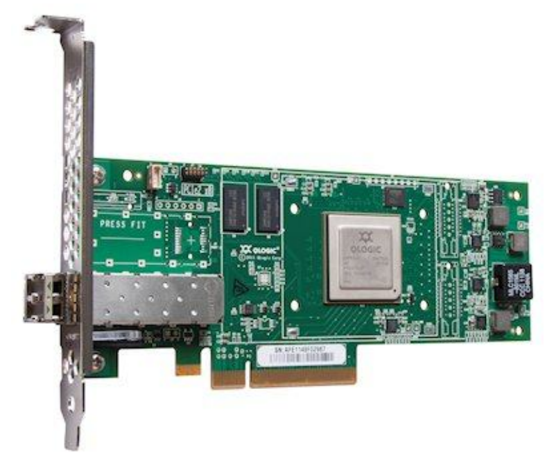
Figure 2. QLogic 16 Gb FC Single-port HBA