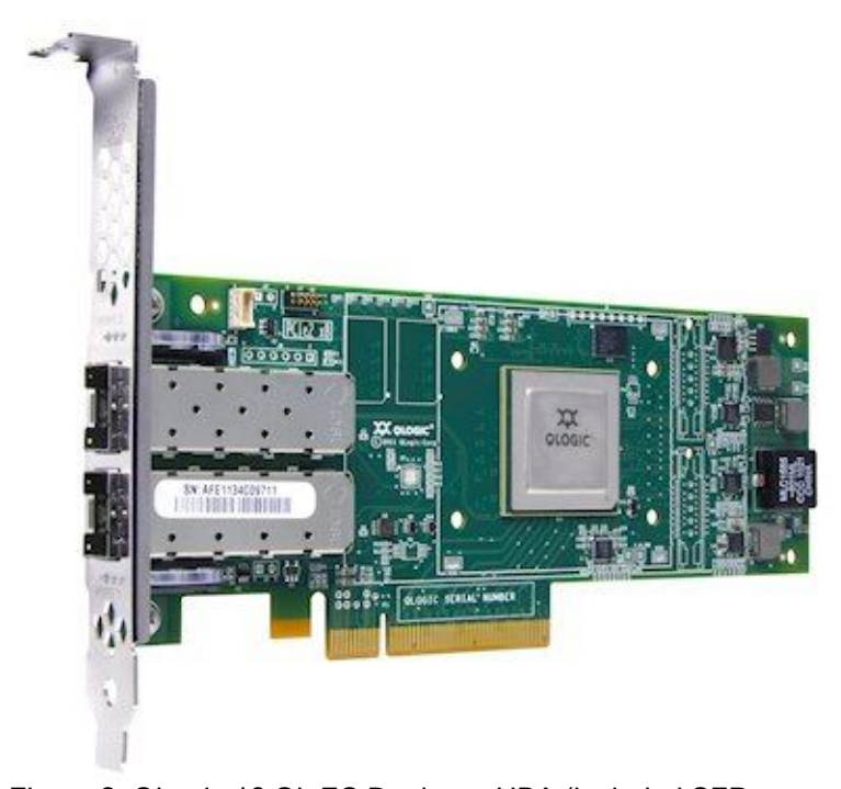
Figure 2. QLogic 16 Gb FC Dual-port HBA (included SFP+ transceivers are not present)