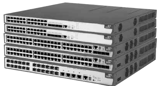
from top: 3Com Switch 5500G-EI 24-Port, Switch 5500G-EI PWR 24-Port, Switch 5500G-EI 48-Port, Switch 5500G-EI PWR 48-Port, Switch 5500G-EI 24-Port SFP

The 3Com Switch 5500G family consists of five models: 24 or 48 ports, 10/100/1000, with or without PoE; a fifth SFP model offers 24 SFP Gigabit ports. Four ports on each of these models are dual-purpose or “dual-personality”, functioning as either 10/100/1000 or with fiber Gigabit SFPs. Two of the four SFP ports are capable of supporting Fast Ethernet fiber (not available on the 24-port SFP model). All models provide a slot for a 1- or 2-port 10-Gigabit module, enabling switch capabilities to grow with the needs of the network.