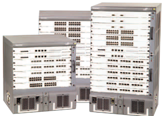
from left: 3Com Switch 8807, Switch 8810, Switch 8814

Application modules for the Switch 8800 provide the flexibility to add a firewall, IPsec encryption, network monitoring with NetFlow, and Layer 2 VPN networking using Virtual Private LAN Service (VPLS) by simply adding a module to the chassis.