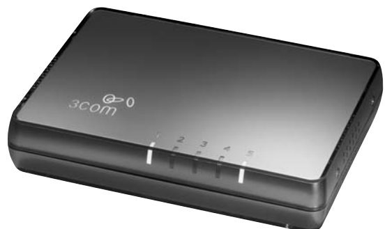
Shown above is the 3Com Switch 5 Port 3CFSU05

Operating system independence. Supports maximum integration of different operating systems within a network—no extra configuration of the network is required.