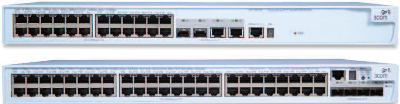
from top: 3Com Switch 4500 26-Port, Switch 4500 PWR 50-Port

Refer to www.3com.com/warranty for details.