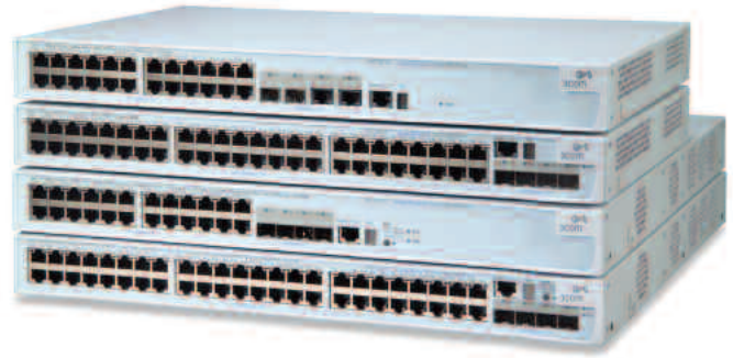
from top: 3Com Switch 4500 26-Port, Switch 4500 50-Port, Switch 4500 PWR 26-Port, Switch 4500 PWR 50-Port

Intelligent and secure edge connectivity, ideal for small and medium enterprise and branch office networks