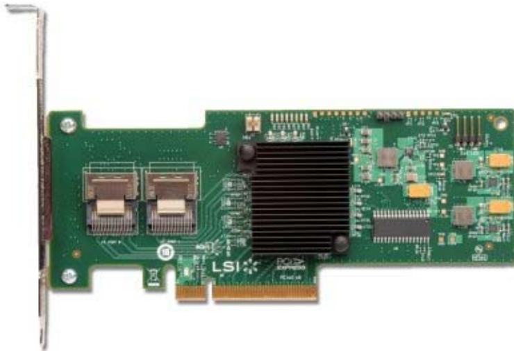
Figure 1. ServeRAID M1015 SAS/SATA Controller

The ServeRAID M1015 SAS/SATA Controller for IBM System x is an entry-level 6 Gbps SAS 2.0 PCI Express 2.0 RAID controller. The adapter has two internal mini-SAS connectors to drive up to 32 devices and supports the same base RAID 0, 1, and 10 feature set and drivers as the M5000 series controllers. With the attachment of the ServeRAID M1000 Advanced Feature Key, the ServeRAID M1015 offers the option of RAID 5 and SED Encryption Key management, while still being sensitive to administrator cost concerns in an entry-level RAID environment. This RAID controller provides connectivity to internal direct-attach or expander-attached hard disk, solid-state, or self-encrypting drives.