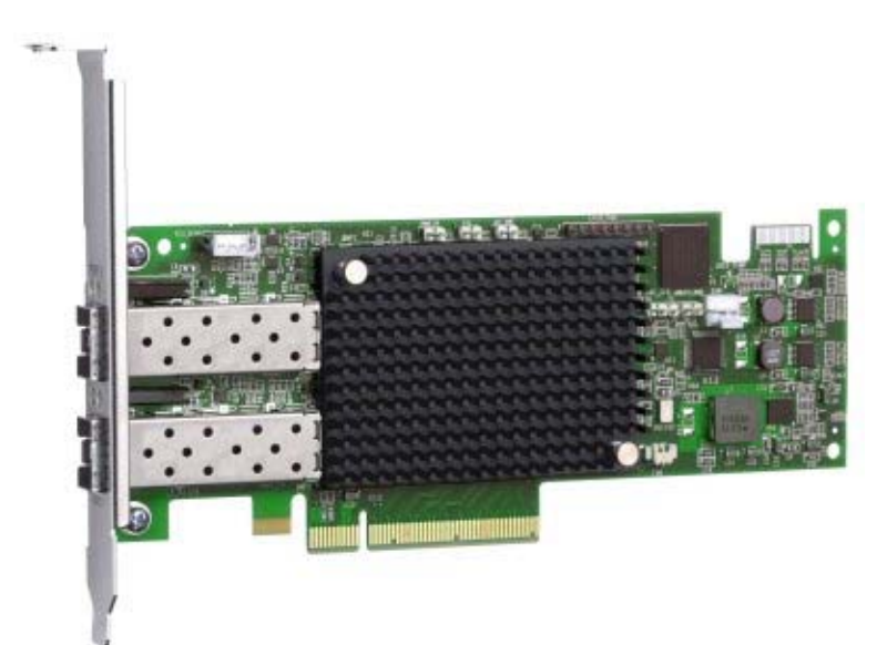
Figure 2. Emulex 16Gb FC Dual-port HBA (with 3U bracket attached; SFP+ are not present)

The following figure shows the dual-port adapter (SFP+ are not present).