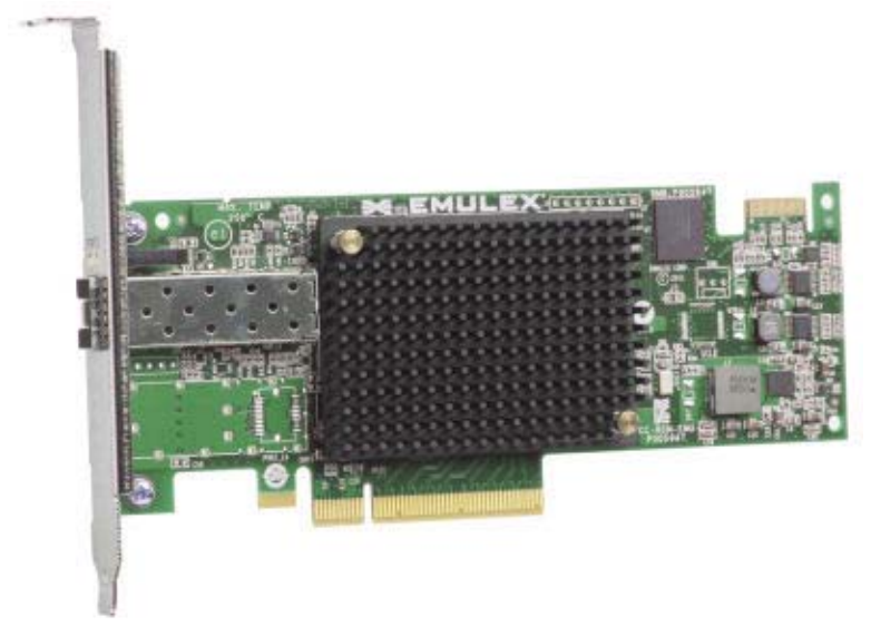
Figure 2. Emulex 16Gb FC Single-port HBA (with 3U bracket attached; SFP+ is not present)

The following figure shows the single-port adapter (SFP+ is not present).