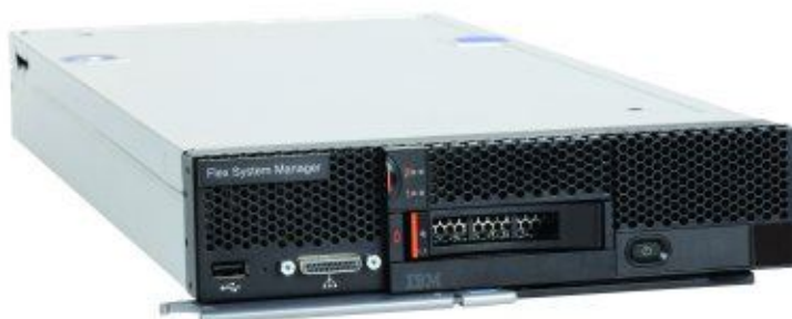
Figure 1. IBM Flex System Manager management appliance

The IBM Flex System Manager management appliance is shown in the following figure.