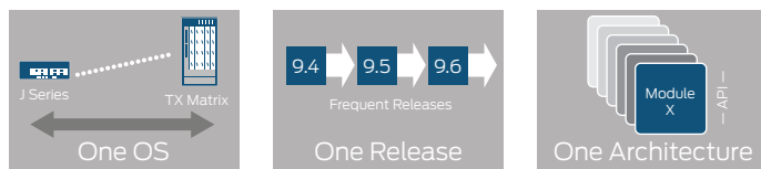
Figure 2: Junos OS utilizes a single source code, adheres to a consistent and predictable release train, and employs a single modular architecture.

These attributes are fundamental to the core value of the software, enabling all products powered by the Junos OS—routers and switches—to be updated simultaneously with the same software release. All features, new and old, are fully regression-tested, making each new release a true superset of the previous version. Customers can deploy a new Junos OS release with complete confidence that all existing capabilities will operate in the same way and be compatible on all Juniper Networks switches and routers in the network.