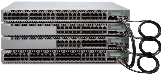
Figure 1: EX3300 Virtual Chassis connections

The EX3300 implements the same slot/module/port numbering schema as other Juniper Networks chassis-based products when numbering Virtual Chassis ports, providing true chassis-like operations. By using a consistent operating system and a single configuration file, all switches in a Virtual Chassis configuration are treated as a single device, simplifying overall system maintenance and management.