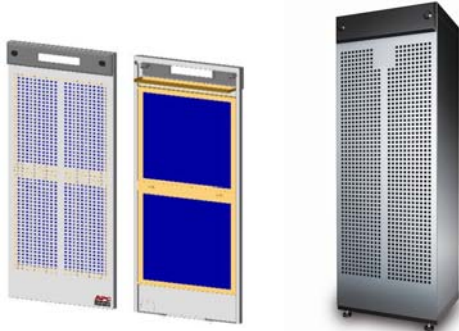
User-replaceable air filters

Allow the UPS easily to be rolled into place