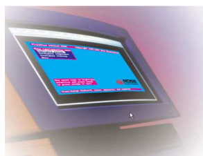
UltraView Pro on-screen menu

With its advanced on-screen menu system, built-in security, flash memory, easy expansion, front panel controls, and other features you start to get a sense of the UltraView Pro advantage.