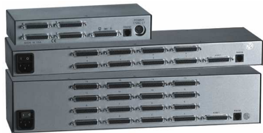
Rear view of UltraView Pro, 1x4 top, 1x8 middle, 1x16 bottom

■ Phone: 281-933-7673 ■ E-mail: sales@rose.com ■