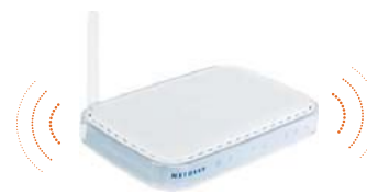
Super-G Wireless Router (WGT624)

Laptop connects with Super-G Wireless PC Card (WG511T)